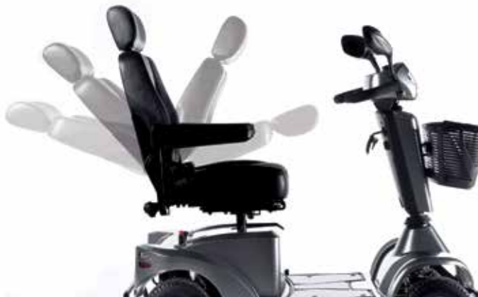
→ Quick backrest angle adjustment