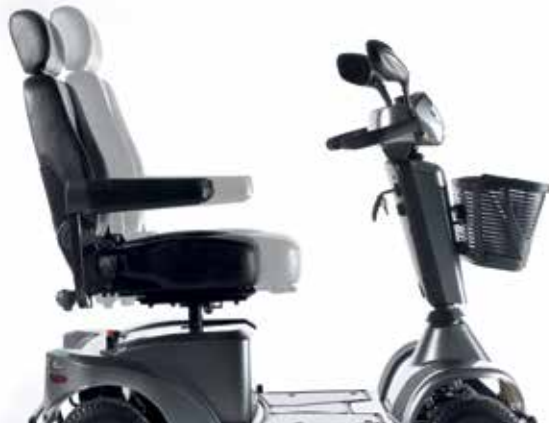
→ Infinite seat depth adjustment

The S-SERIES advanced seating solution, takes comfort to the highest level, from the seat height, depth and recline adjustments, to the flip-up, width, angle and depth adjustable comfort armrests – every feature has been designed for comfort – for you.