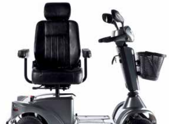
→ Seat rotation enables comfortable transfers